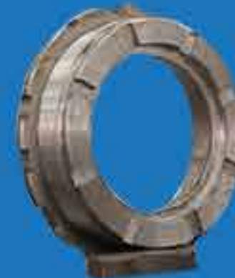
Trans shaft nut modified to MP 3