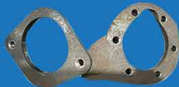
Fixed piece for camshaft