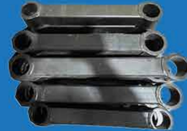
Hard trailer hitch