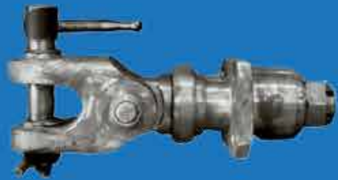
Full hinged hook