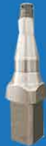
Trailer dangle Axe