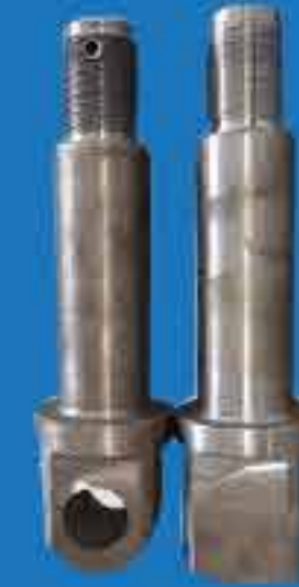
New Hook Pillar