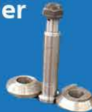
Trailer tipper bolt and internal and external fixed loader