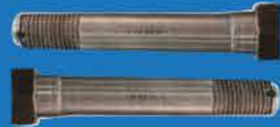
Trailer hitch bolt